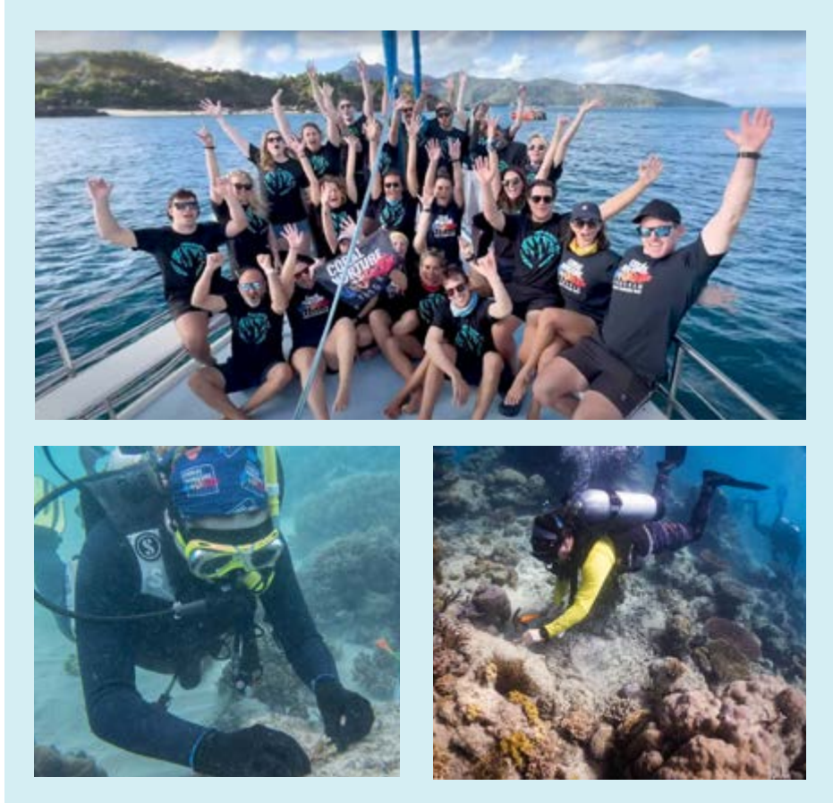
Top: The Coralpalooza team in action. Above left: Researchers on Oceanfree planting coral fragments in Cairns. Above right: Researchers on Sailaway in Port Douglas using the coralclip®.

Excitement filled the air at the Whitsundays, Cairns and Port Douglas marinas on June 10 as Coral Nurture Program researchers, local tourism operators and volunteers busily prepared for a day of intensive coral planting on the Reef. To the untrained eye, they could have been part of the throng of tourists heading out for a day of relaxation, if it wasn't for their distinctive shirts marked Coralpalooza 2023.