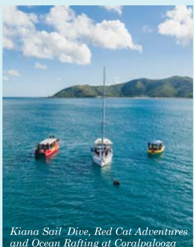
and Ocean Rafting at Coralpalooza in the Whitsundays.

These amazing results could only be achieved because of the infectious passion shared above and below the surface. This was a team in its element, from different backgrounds, skillsets and organisations but with one collective intent – to make a positive impact on the Reef. Each coral fragment was planted using the innovative CoralClip® - a Queensland invention that allows corals to be planted quickly and with good survival rate.