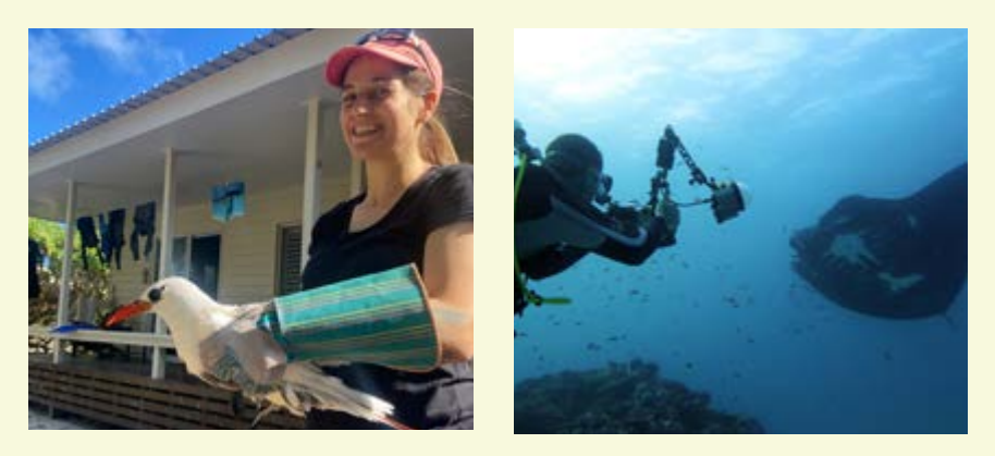
Above left: Monitoring red-tailed tropicbird on Lady Elliot Island. Above right: Diver photographing manta ray for Leaf2Reef research project.

So far two preliminary achievements have been made which act as foundational milestones for the research program.