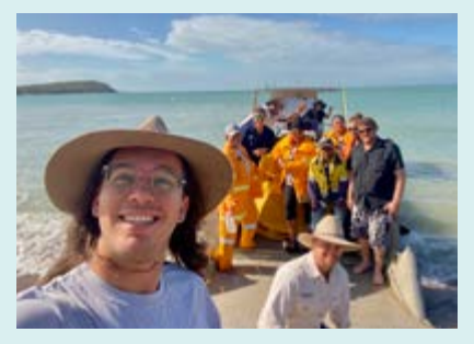
Avoid Island fire training.

These findings have far-reaching implications for the project. They will be used to develop a geological field guide of the island and will directly contribute to the island's management plan, inform the creation of educational resources and guide conservation efforts.