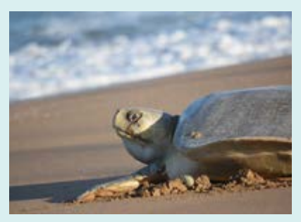
Nesting flatback turtle returning to the sea at daybreak on Avoid Island.