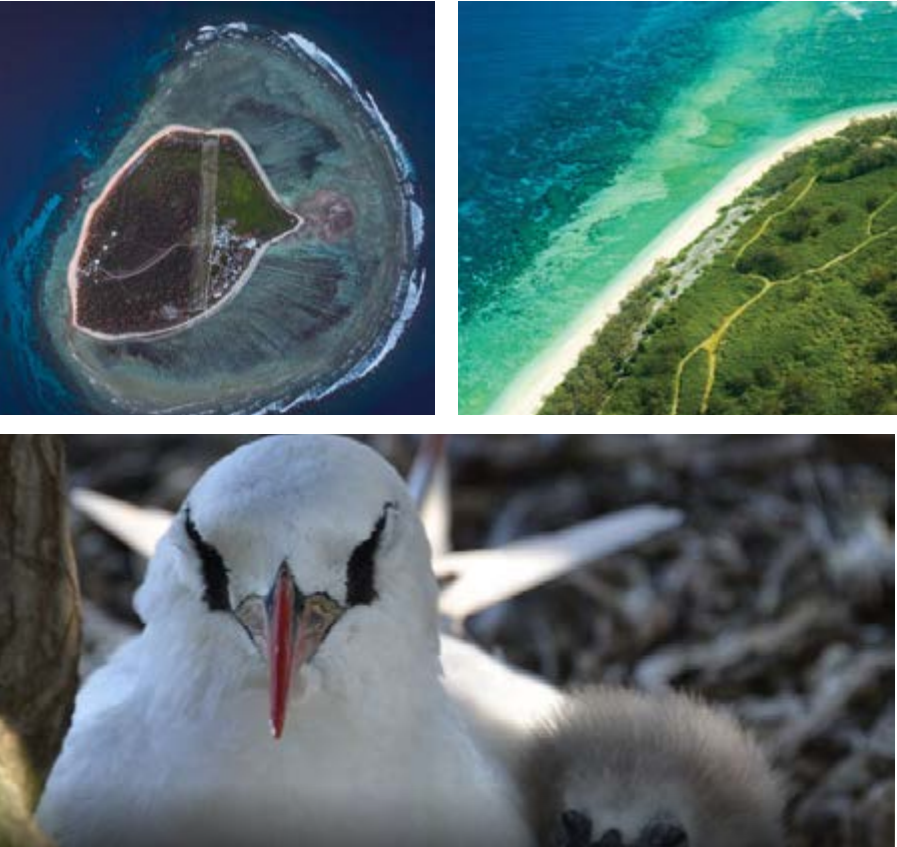
Since 2018 the number of red-tailed tropicbird breeding pairs have increased from 2 to 9.

Below: Aerial views of Lady Elliot Island showing the progress of revegetation work.