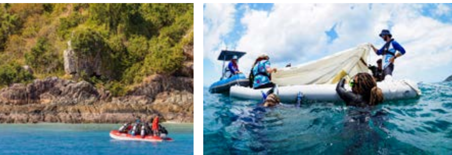
Above left: Coralpalooza boat as part of Coral Nurture Program. Above right: Boats4Coral deployment.

potential of this method. This has enabled the Foundation to secure corporate investment to scale these activities across the Reef.